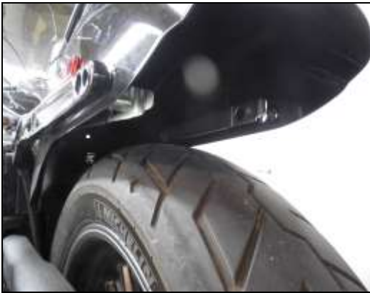
Rear Fender Mounting Bracket