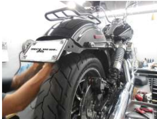
Mounting Bracket Installed