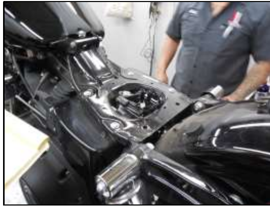
Access to wire connections