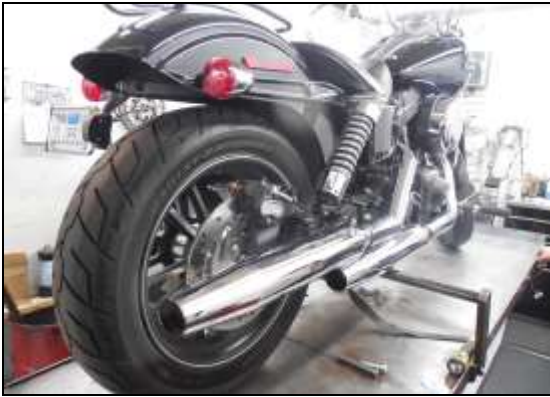
Motorcycle on Jack with Shocks Disconnected