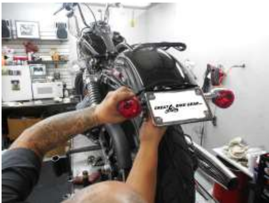
Turn Signals Installed